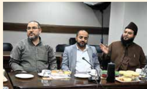
Delegation from Gazze Destek Organization (GDD - Gazze Destek Demeği) from Istanbul, Turkey, visits IPS (May 7, 2024).