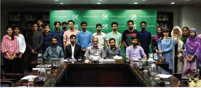
For further details, visit: https://www.ips.org.pk/nexus-between-good-governance-public-administration-signified-before-the-students-of-quaid-i-azam-university/

individual interests. This vision and sincerity are the cornerstones for leveraging collective benefits, ensuring that governance serves the greater good rather than personal gains. He underscored the significance of mental development and mindset in fostering effective governance.