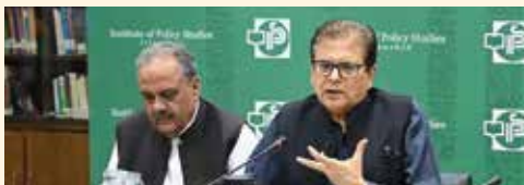
Amb Asif Durrani and Amb Mohammad Sadiq

Upholding the rule of law through a balanced approach by both sides is crucial for restructuring Pak-Afghan relations in the post-August 2021 context, given the internal complexities and external influences shaping their bilateral relationship.