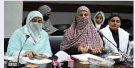
For further details, visit: www.ips.org.pk/ensuring-rights-in-the-family-review-of-legislative-proposals/

The experts raised concerns about the legal definition issues within the proposed matrimonial asset bills. They highlighted multiple ambiguities in the language of the proposed bills and warned that vague terms could lead to future legal disputes.